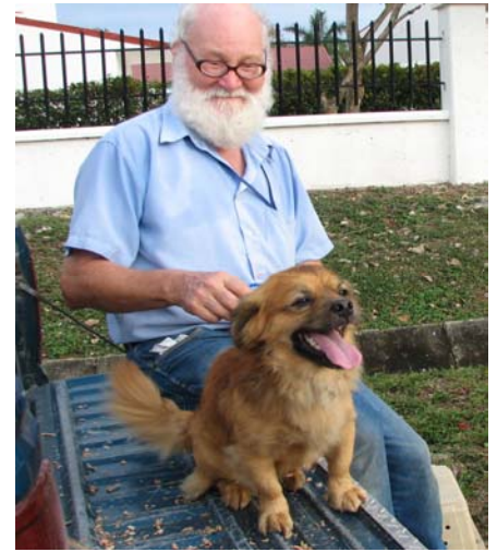
“SOLLY” rescued by none other than ‘Santa Paws’. Fostered and adopted by a caring family in Teakettle.