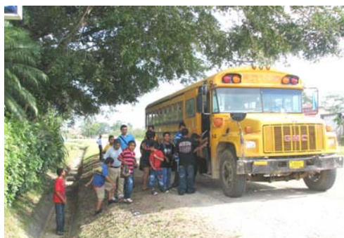
Thanks to BMPCITCO loan of bus to transport graduates to Belize Zoo