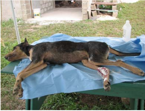
“SNOOP”—Hit and run victim, after long term loving care by his rescuer, his broken leg has mended and he’s happily running around. BHS subsidized his rehab and neuter.