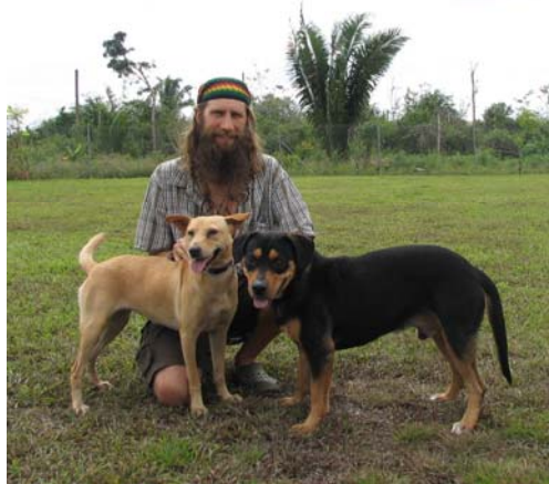
“LILY” and “ROCCO” lucked out, rescued by private individuals & lovingly brought back to health. Adopted at one of our adoption viewing and are living a beautiful life.