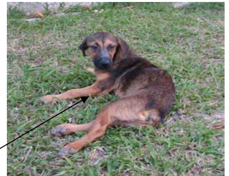
This poor young dog was a hit and run victim on Haulover Street. With his back broken he dragged himself onto the front yard of an unfenced property. There he lay for one week until a concerned resident called BHS. Luckily he couldn't feel any pain and a young boy had been giving him water and his left over dinners. I held him in my arms and he knew he was loved when he fell asleep