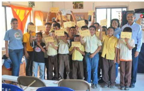
St. Michael's graduates