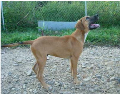
“DINI” one of Gypsy’s puppies was discovered by a family at our Adoption Viewing! He really wanted to be an “only dog” and got his wish. His pack is two adoring kids.