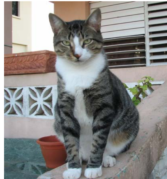
“MR. LEO” adopted to his 4th home in two short years. He is just the most loving kitty. Lets hope this is his forever home.