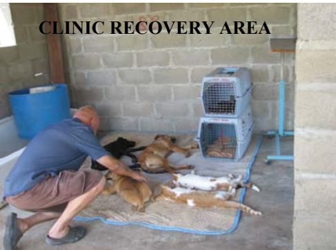
CLINIC RECOVERY AREA

Our few trusty donation cans always bring in donations that go directly toward the subsidized spay and neuter clinics.