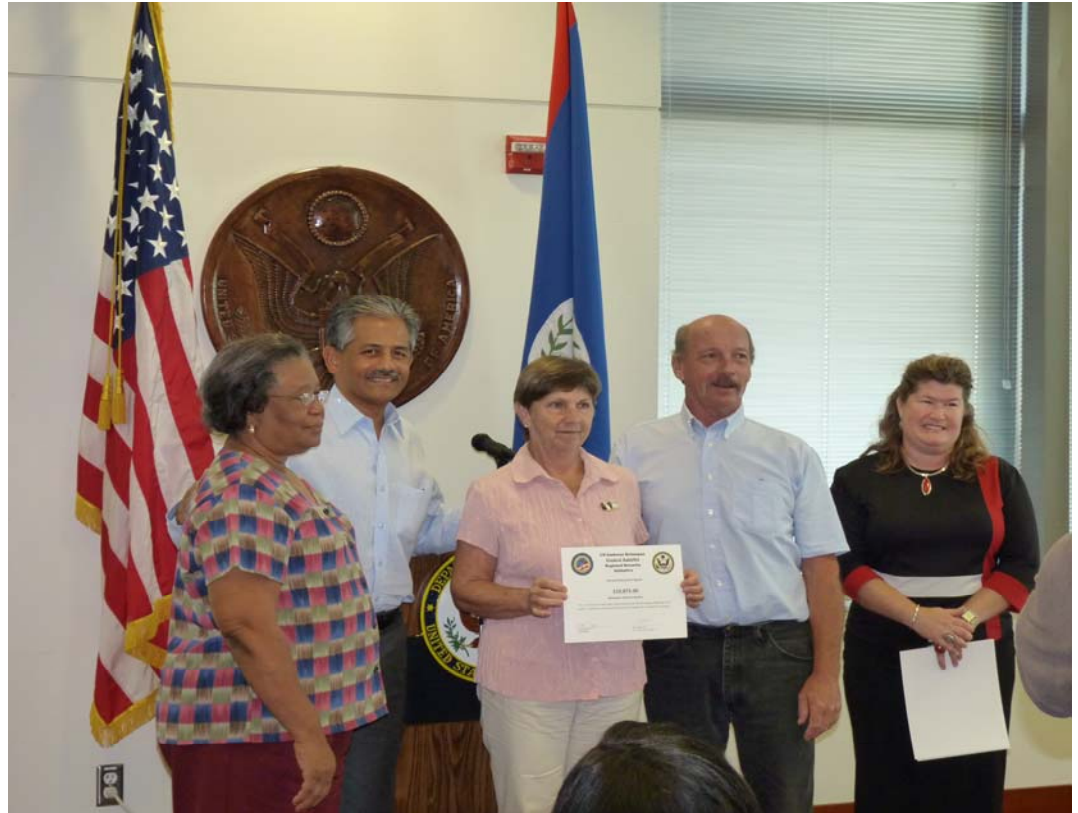
BHS proudly receiving a BZ$20,000.00 grant enabling us to teach the "BE KIND BELIZE" after school program starting mid January 2011.