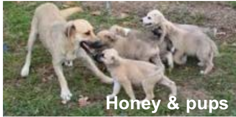
Honey & pups