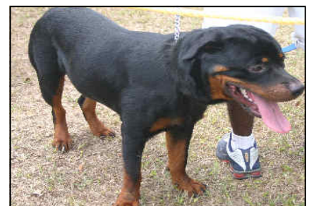
Best In Show Owner Ivor Zuniga